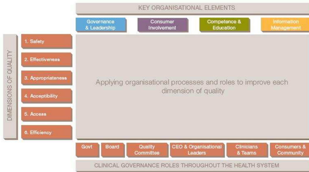
Figure 1: Diagrammatic representation of Victorian Quality Council Safety and Quality Framework (2003)

Directors, Coordinators, Team Leaders, Clinicians, Quality Improvement & Community Services Accreditation (QICSA) Reviewers, QICSA internal contacts and Clinical supervisors. The VQC framework which articulates the four key organisational elements for effective improvement of quality health care 2 was utilised to guide the discussions of the focus groups. Reflection on current or future initiatives was also sought as well as the identification of specific models that support improved clinical practice. The VQC framework was useful in identifying the potential gaps in quality and safety activities at a service delivery level.