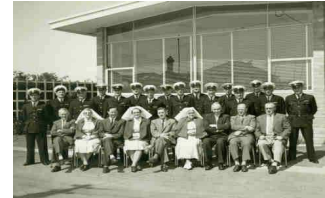
First training officers course 1961, Coliac